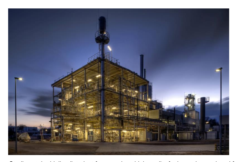
Studies at the bioliq pilot plant focus on how high-quality fuels can be produced from biomass.

Federal Ministry of Agriculture Funds Project on Environmentally Compatible Diesel Fuels Produced from Renewable Resources