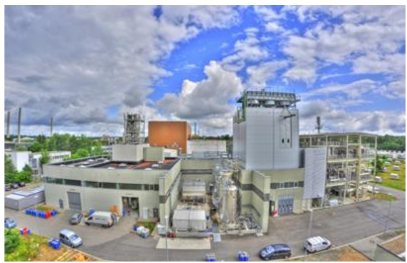
The bioliq® plant at KIT: In a multi-stage process, high-quality synthetic fuels are produced from straw and other biogenous residues.

Successful Operation of Synthesis Stage of the bioliq<sup>®</sup> Pilot Plant – Multi-stage Process Produces High-quality Fuels from Residual Biomass